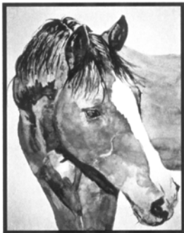
Stacy Hoffhine Yaap Artist

MUST SELL - $7000 OBO. 1994 bumper pull Sooner aluminum 2-horse slant load trailer. Super-size dressing room, oversize stalls, many extras. Well maintained. 719-593-7310.